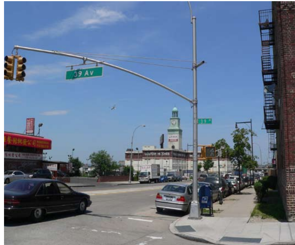
EXISTING CONDITIONS - COLLEGE POINT BLVD.